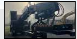
2023 Rotobec Evolution 965 Log Loader S/N: 196302-1-1, Cummins QSB 6.7 Tier 5 Stage V (173 HP), 32'6" Boom Bar, Saw/Pull Through, Hydraulic Optio Carrier Ready Less, Main Valve Option, Dead Heel