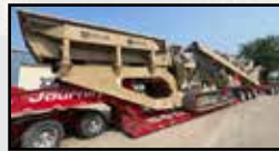
2019 KPI-JCI FT4250CC S/N: 418786, 2,525 Hrs., CAT C13 Tier IV 1800 RPM (440 HP), Radio Remote and Tether, 4250 Horizontal Shaft W/HD Solid Rotor, Variable Speed Hyd. Crusher Drive, 4 Bar Rotor 2 Full Bars and 2 Half Bars