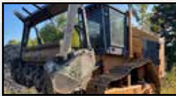
2019 CMI C475 Mulch and Mowing S/N: CA400302, 1,972 Hrs., Caterpillar Tier 4F C-13 (475HP), 4 Pump Hydraulic System Attachment, One Piston Pump Track, Two Piston Pumps, Auxiliary Function