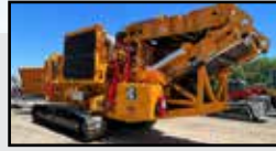
2022 CBI Magnum Force 6800CT S/N: 011271, 650 Hrs, CAT C27 Tier 4F Diesel Engine (1,050HP), PT Tech HPT021 Hyd. Clutch, Auto Reversing Fan Sys., 40" x 60" Hammermill (24 Hammer Pattern)