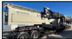
2022 Astec GT205MF S/N: 225222, 527 Hrs., CAT Tier IV (129HP), Engine Mounted Hyd. Pumps, 2520K Two Deck MF Screen, 5'x20' Top Deck, 5'x18' Bottom Deck, 950 RPM Vibrating Mechanism, 18" Channel Frame