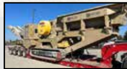
2018 KPI-JCI FT2650 S/N: 418595, 1,154 Hrs., CAT C9.3 Tier IV 1,800 RPM (300HP), Radio Remote and Tether, 2650 Pioneer Jaw Crusher, Hyd. Dual Wedge Adjust, CSS Hyd. Drive for Crusher, Full Belly Jaw Dies and Remote Grease