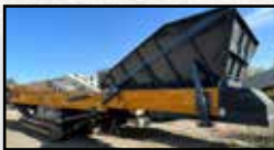
2023 Terex TSC80T Conveyor S/N: P21387, 23 Hrs., Deutz TD 2.9 L04 (60 HP), Large Capacity Biomass Hopper, 78'9" Drum Centres Giving a Max Stockpile Height of 34'6" at 25 Degrees