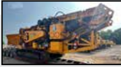
2019 CBI Magnum Force 6400CT S/N: 019084, 1,155 Hrs, C27 1,050HP, Brute Rotor Package, Cross Band Magnet