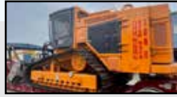
2023 CMI C500 S/N: CU503402, 487 Hrs., Cummins Tier 4F X-15 (500HP), 4 Pump Hydraulic System, Attachment One Piston Pump, Track Two Piston Pumps, Auxiliary Function One Gear Pump, 12 Volt Electrical System